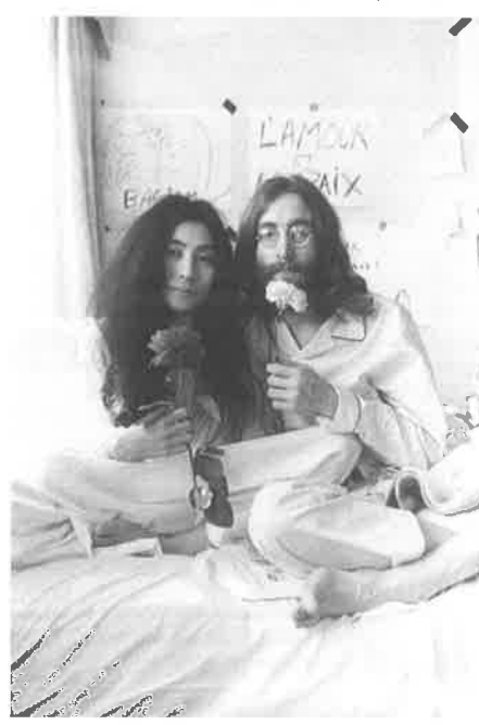
Yoko Ono and John Lennon, Montreal Bed-In , 1969.

Moving into the East Wing of the museum, there is a selection of works from the 1960s onwards, showing practices of Conceptual and Performance Art, each radical in their time. Conceptual Art proposes that the artistic idea has greater significance than the aesthetic, material form. It questions the nature of art itself and the role of the artist in its making. Video and photography as documentation and representation feature strongly in these galleries, together with the use of text. What We Call Love brings to the fore a focus on love not often associated with Conceptual and Performance Art practices.